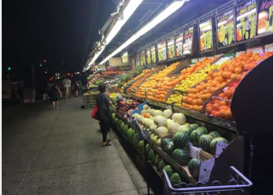
Ample food choices in farmers markets and local stores should offer healthy choices

Our neighbourhoods must respond to the needs of 21st Century lifestyles and they need opportunities for their inhabitants to flourish in local life and participate in meaningful neighbourhood decision-making. Perhaps then, as neighbourhood attachment grows, residents will enjoy their neighbourhood not only because it's their living environment but also because it helps them fulfil their potential.