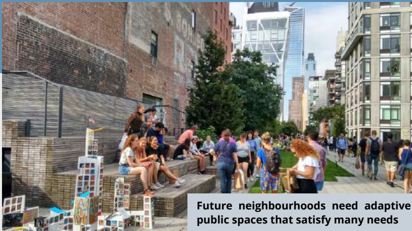
Future neighbourhoods need adaptive public spaces that satisfy many needs

I had a fairly happy childhood. The suburban village my parents adopted as a family home offered the necessary amenities - two small grocery stores, a bakery, fresh produce store, kindergarten, primary school and a small library. And they were all within a ten-minute walk. We also had a home garden, we could play on the street and I was surrounded by the green fields and nearby hills that became my beloved recreational spots.