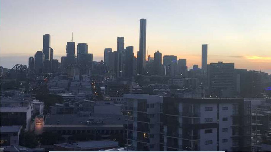
Noise in the city - a major impact on livability