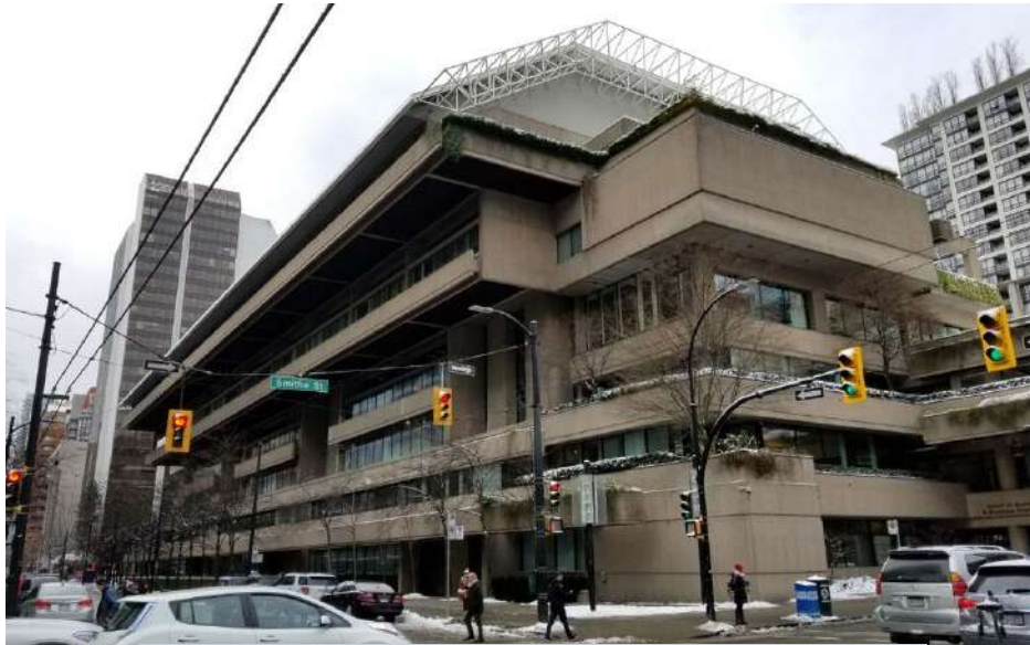
Noise in the city - a major impact on livability

Fortunately, communities all over the world are starting to pay attention to noise pollution. New technologies are helping to better discern the impacts of noise pollution, and laws and regulations already in place are beginning to expand. In fact, organizations like Noise Free, have made it their mission to reduce noise pollution as part of a larger public health mandate.