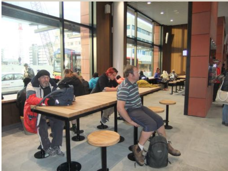
One of several seating options in the Bus Interchange

In its final form, there is a strong relationship between the interior of the building and the street, providing good visibility internally and externally. Instead of deeply recessed entrances, these are shallow, eliminating possible entrapment zones.