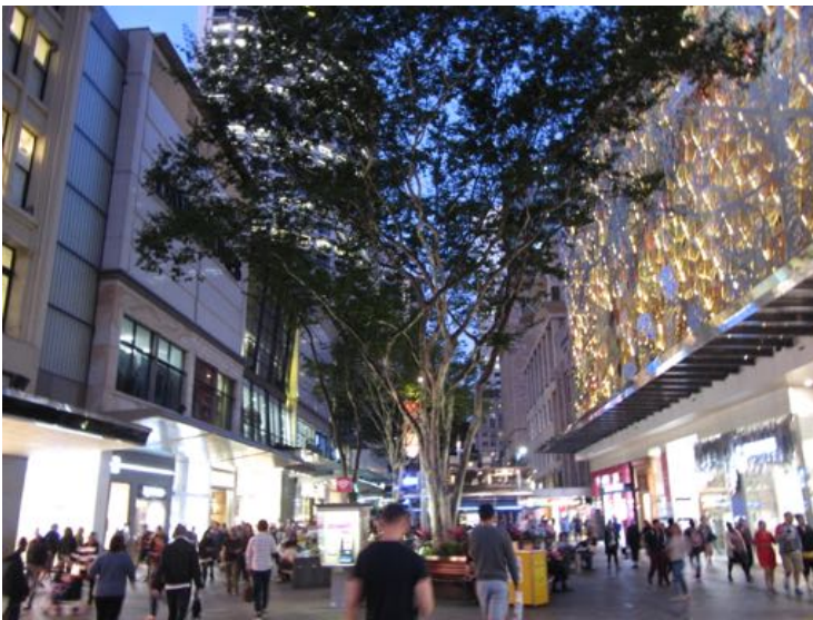
Successful malls have extensive mix use

The Mall is a complex space with active use from a mix of activities. During the 1999 refurbishment that included CPTED as part of the new city plan, special attention was given to decluttering the Mall of its permanent built structures, better legibility, clear sightlines and open design to enhance safety and feelings of safety.