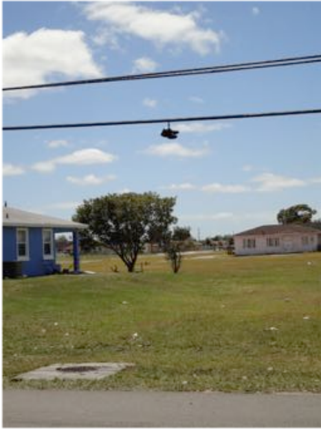
Drug dealers mark locations