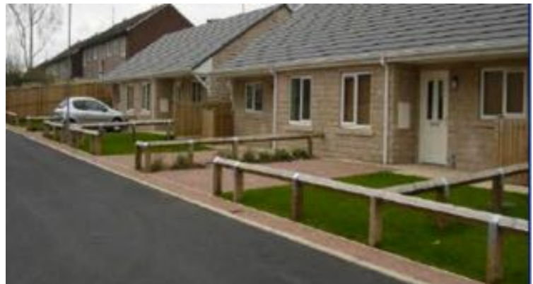
Informal surveillance was cited as the most common deterrent