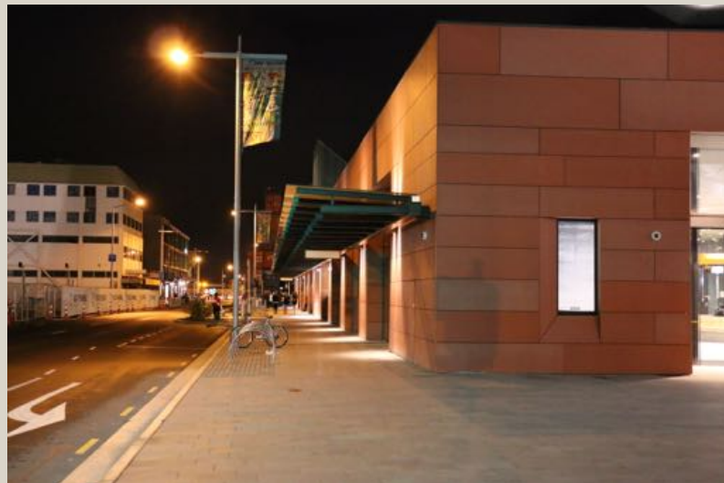
North facing frontage of Bus Interchange on Lichfield Street