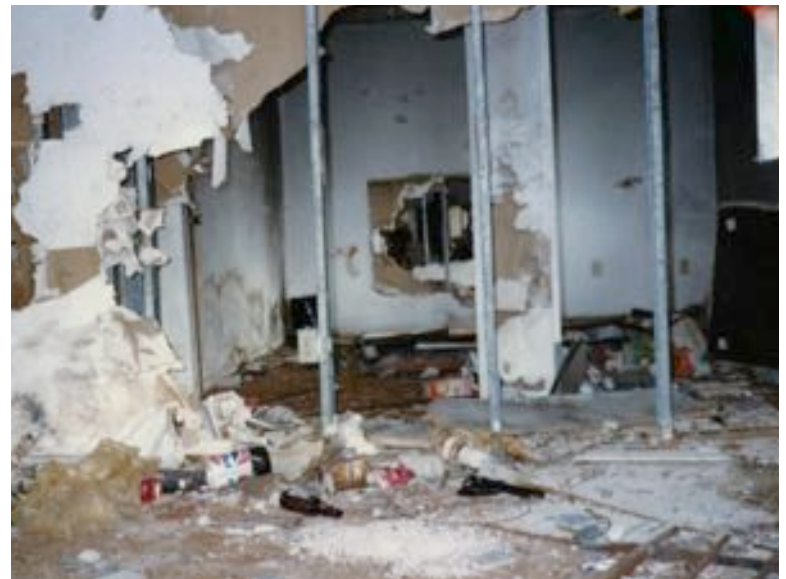
Dealers burrow through walls to escape police

Enforcement is also needed. Better quality, real-life training for police officers in crime prevention, CPTED, and problem-solving rather than just criminal apprehension would help.