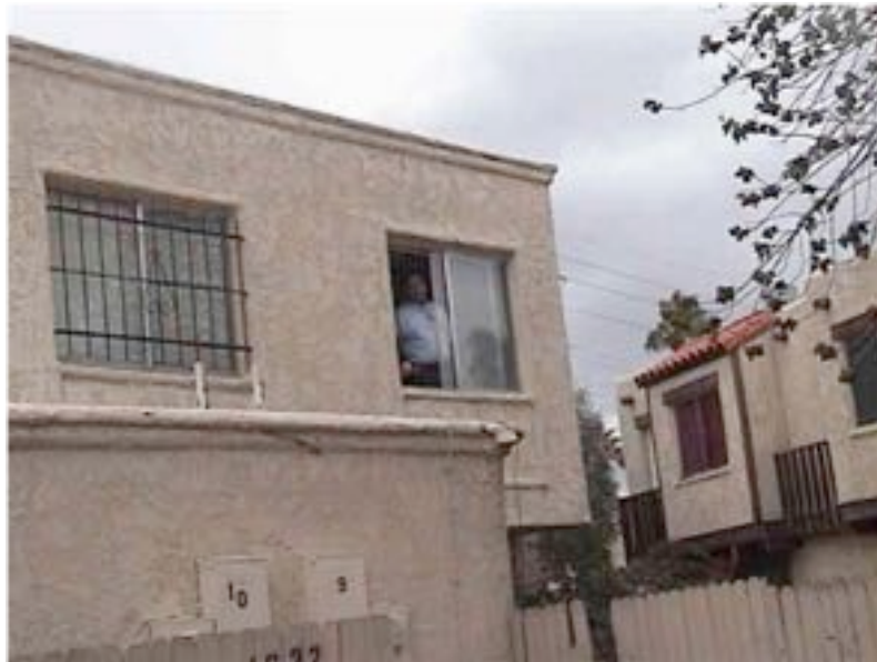
Corner vantage point for surveillance

One major group of users who have successfully used the principles of Defensible Space and CPTED are drug dealers and criminals. Criminals have access to the two key requirements for Offensibile Space: resources and consensus.