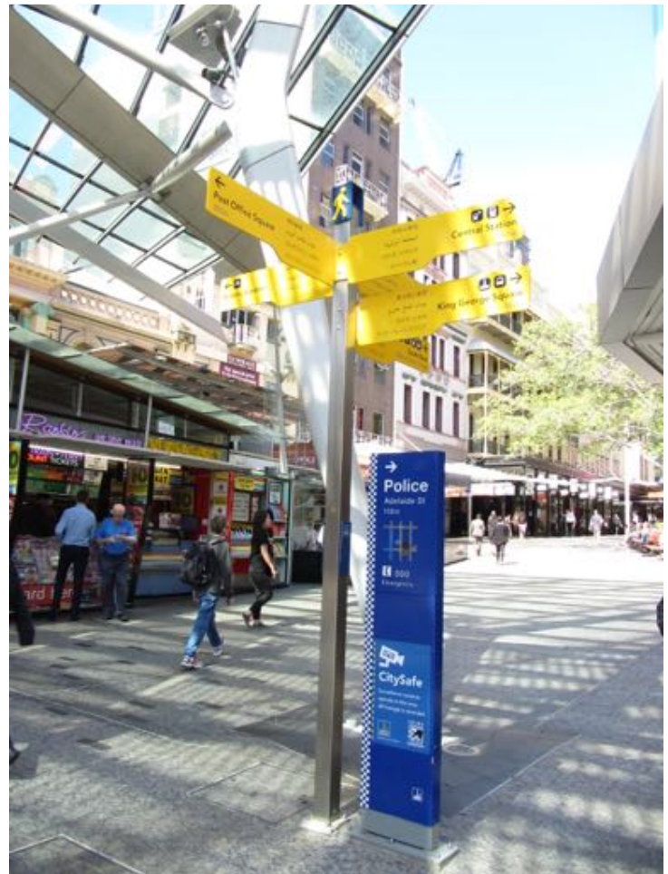
Proper wayfinding and maintenance

At 500 metres (1,500 feet or 6 city blocks) it is the same length as successful pedestrian malls in North America, such as Calgary's Stephen Street Mall or Boulder's famous Pearl Street Mall. However, unlike many other malls, it combines an active night-time use as well as direct links to the major underground central city bus station. The Queen Street Mall has explicit CPTED strategies incorporated into the design and it boasts an extensive mix of commercial, cultural, entertainment and dining activity.