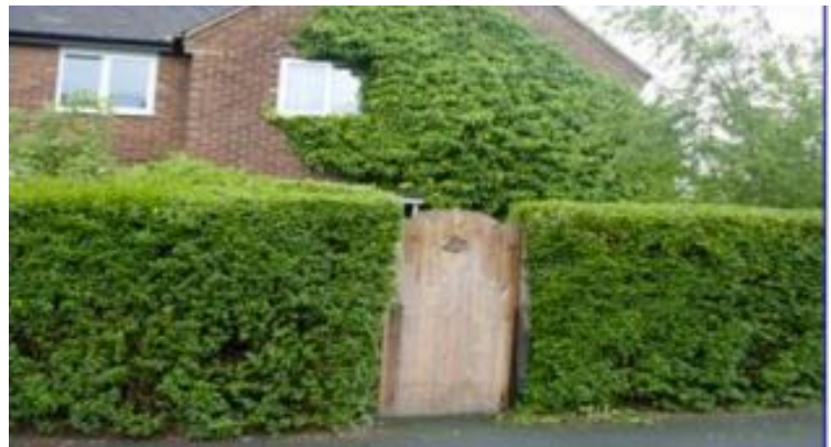
Burglars described what attracts them to targets

Other principles, whilst influencing offender decision-making, appeared less important – the concept of defensible space was referred to by 36% of the sample and on only eleven occasions. It is hoped that the research can be used to improve the evidence base surrounding the impact of housing design on crime, and crucially, to review and reconsider CPTED to ensure that it is aligned with the perceptions of those who abuse it.