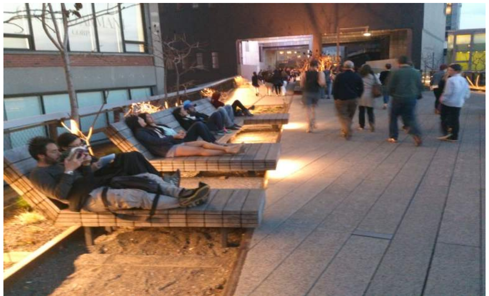
Lounging in High Line Park at night

The opportunity for night time activity is abundant.