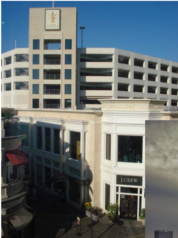
The Grove parking facility, Los Angeles