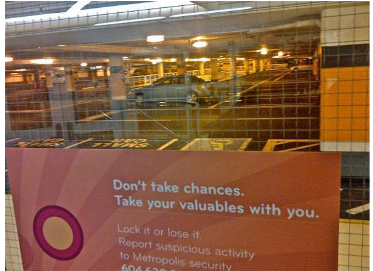
Security signage, open sightlines and even lighting