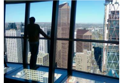
Calgary Tower observation deck overlooking Calgary, site of 2015 ICA Conference

October 19-20, 2015 Coast Plaza Conference Centre, Calgary, Alberta, Canada