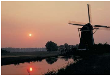
Join delegates in glorious Amsterdam

The 8th International CPTED Conference will be held in Amsterdam on September 24-26, 2003. The conference is being hosted by Senter, an agency of the Dutch Ministry of Economic Affairs, and is expected to attract delegates from around the world. This year's conference is being held as a cooperative effort between the International CPTED Association and the IEEE Society on Social Implications of Technology (SSIT). The conference is entitled the "International Symposium on Technology and Society: Technology, Crime Prevention, and Security", and will provide a platform for the exchange of knowledge and experience on topics relating to crime prevention and the improvement of urban safety through technological innovation and environmental design.